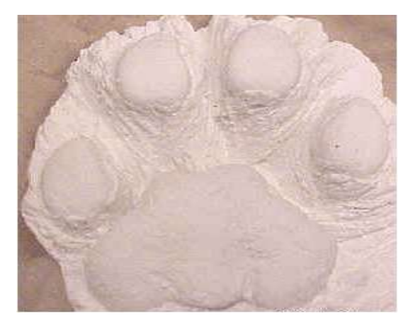
Figure 3Tiger pugmark in plaster of paris

"Fig. 3" shows the pugmark obtained in the plaster of paris by the conventional method of tiger census. This image was collected from the database of the agencies related with this field.