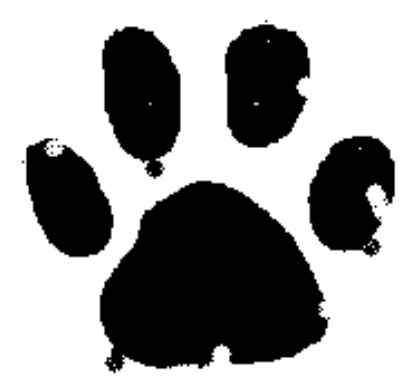
Figure 7 Results of Binarization

"Fig 7" shows the result of binarization. The white pixels and black pixels are associated with object blobs are the noisy pixels.