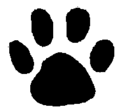
Figure 8 Results after Noise Elimination

IOSR Journal of Electronics and Communication Engineering (IOSR-JECE) e-ISSN: 2278-2834, p- ISSN: 2278-8735. PP 49-57 www.iosrjournals.org