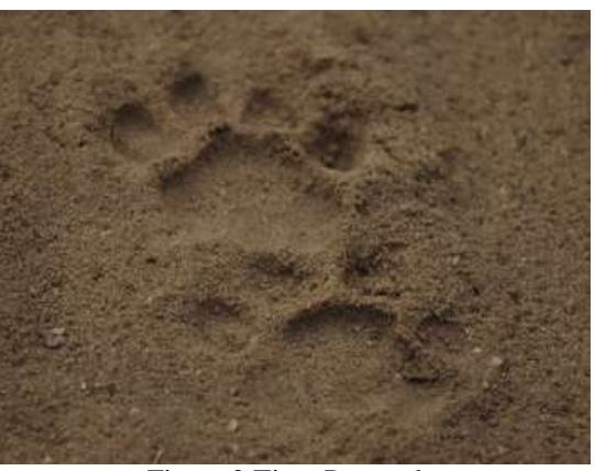
Figure 2 Tiger Pugmarks

IOSR Journal of Electronics and Communication Engineering (IOSR-JECE) e-ISSN: 2278-2834, p- ISSN: 2278-8735. PP 49-57 www.iosrjournals.org