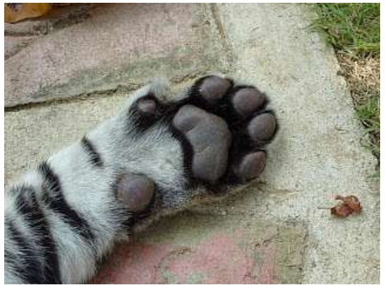
Figure.1View of a Tiger Leg

Tiger census is usually carried out by pouring plaster of paris in the footprint pug mark that was seen in the forests. Then they collect these foot print clays next day. This process is repeated in the entire forest for a period of 3 to 6 months because most of the animals find the way in an unknown environment is the common task carried out by them. Footprint left by animal is not a perfect one. The foot print is usually dirty and partially visible. Animal foot print recognition can be done by software and it will solve many problems associated in this field of study. But this software must be cheaper. The number of foot print exists in an area gives the estimate of how many animals present in an area. The number and size of the blobs in footprint are the commonly used features to identify the animals. This can be effectively done with the use of image processing algorithms. "Fig 1" shows the rear side of the left leg of a tiger and the "Fig. 2" shows the pugmark image that was seen in a zoo.