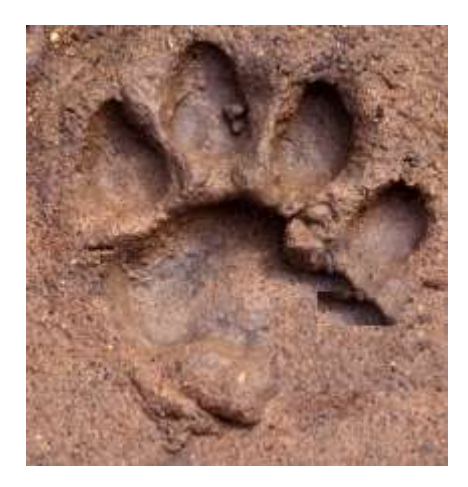
Figure 6 Footprint Image of a tiger

Foot print images was collected from different agencies in kerala state those who participating the tiger censes. Recording of the latest footprint image is a time consuming process if we performed it in forests. For simplicity only one image is shown in "Fig 6".